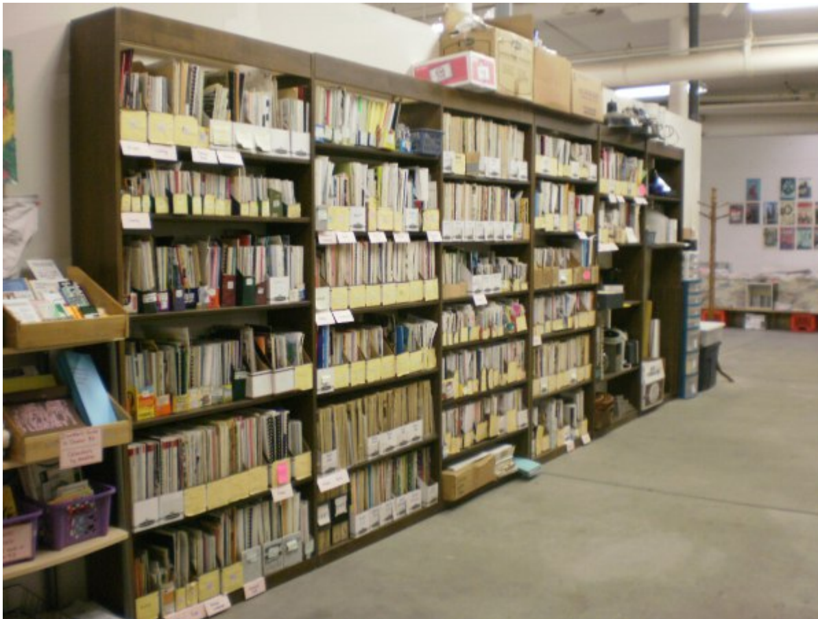
Denver Zine Library.

Vint Cerf, co-designer of the internet's basic architecture and a vice president for research with Google, recently sounded the alarm about "bit rot" or the degradation of data files. He warns that we're facing a "forgotten century" of historical documentation because we lack the computer software and hardware necessary to read obsolete computer files. 1